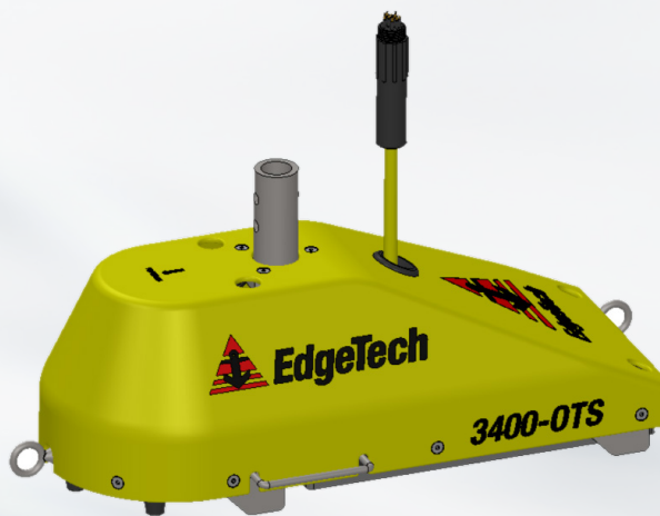
3400-OTS ULTRA & LIGHTWEIGHT